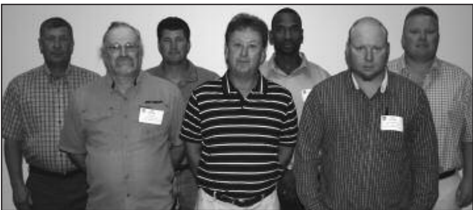
Union Pacific/BMWED Safety Coaches.

Maintenance of Way Safety Coach. UP began their training in Omaha, Nebraska the week of August 31, 2009.