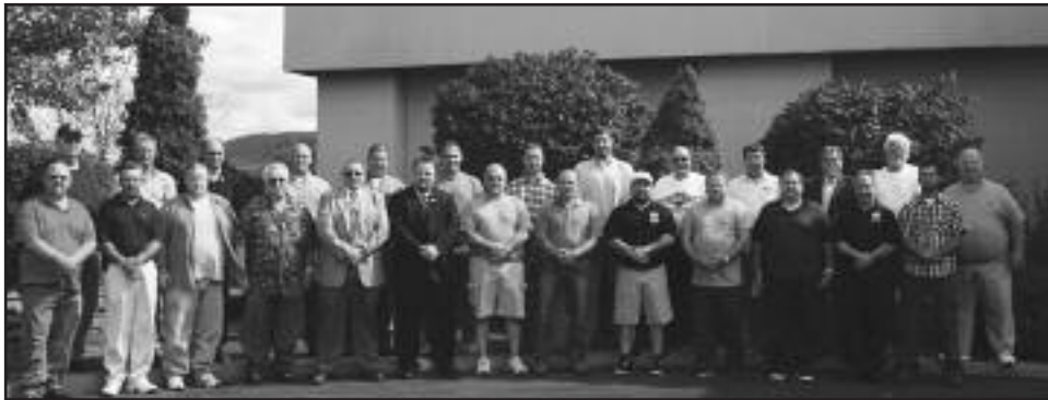
Northeastern System Federation officers and delegates.

Prior to the convention and election of officers, the federation hosted an educational for those in attendance.