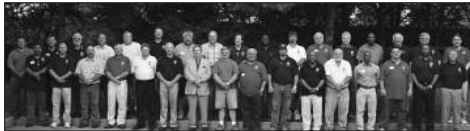
Allied Federation full-time officers and Executive Board members.

was to review the federation finances and to have discussions concerning the good and welfare of the federation.